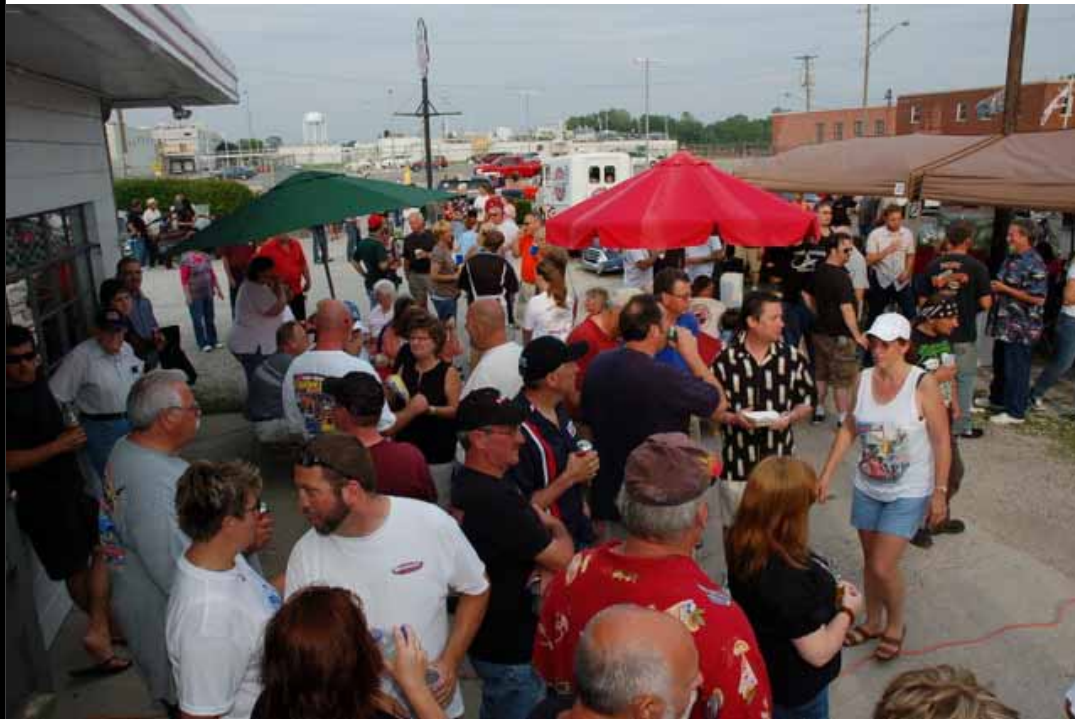
This is an early crowd shot from Spam-A-Rama. (I can tell because the parking lot is not full yet.)

Our signature annual “Spam-A-Rama” held each Goodguys Friday evening. Goodguys brings us visitors from all over the country and has been well attended each year since day one!!! The “Punkin Holler Boys” were back with Hillbilly Happy Hour and we cooked up tons of Spam and some killer hot peppers. The 2011 date has changed as the Goodguys event is being held at the 500 track in September so our new date for Spam-A-Rama will be September 16 th 2011 . Hopefully we can close main street for just hot rods etc..