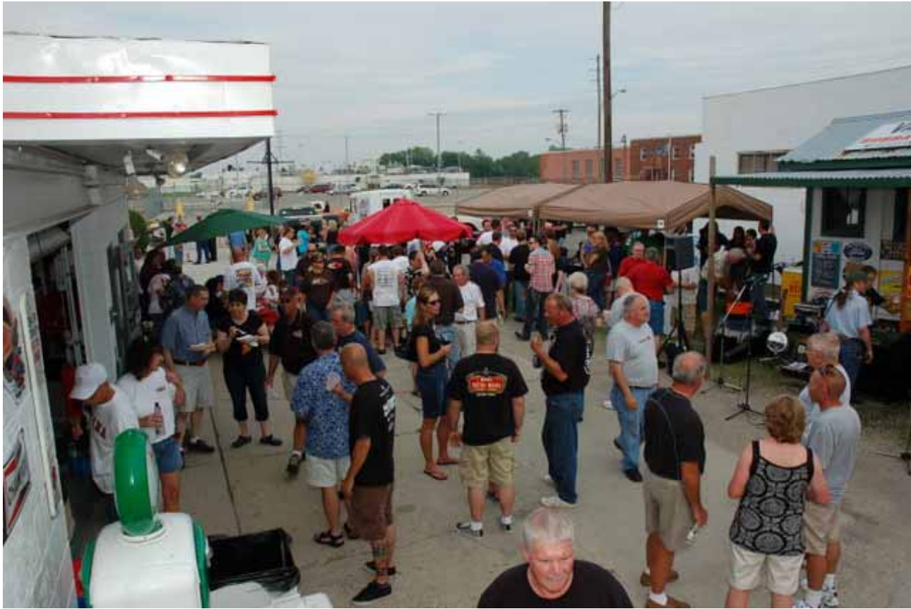
These 2 shots are from Spam-A-Rama 2010. Crowd shot above, and below one of our favorite bands, The Punkin Holler Boys.