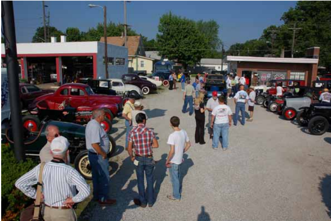
This picture is also from the Model T breakfast in May.

A surprise event for us this year that we wish to continue is NASCAR Haulers on Main Street. This was their second year. All the NASCAR teams are required to line up their haulers on Main Street (in order of points) prior to entering the 500 track. Makes a very interesting line up as they fill the entire street in Speedway. We offered our world famous Dr Pepper Spam and had the "Punkin Holler Boys" playing their Hillbilly Happy Hour hits. Looking forward to this one again next year with a date of Thursday evening July 28 th 2011.