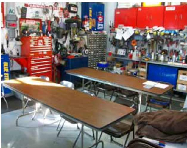
Bubbas Hot Rod Shop & classroom

In this edition of our newsletter I am going to let everyone write a brief summary of their new home with some pictures. I will start with my area: