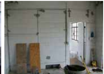
Above: Before - Lower After