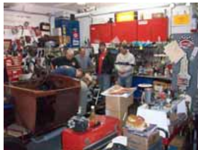
Wednesday is still Hot Rod Night